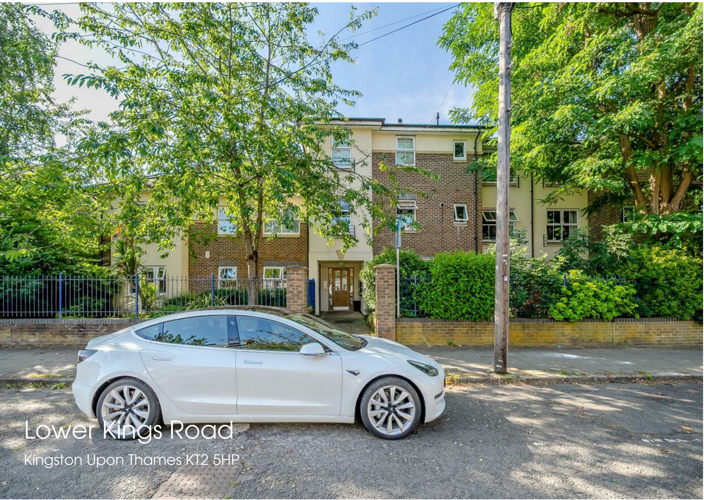
Lower Kings Road Kingston Upon Thames KT2 5HP